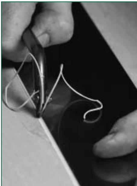
Figure 26 Grooving the seam