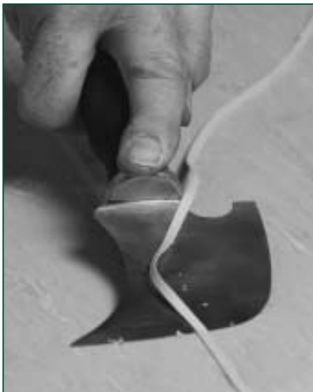
Figure 30 Final trim after the weld has cooled

B. When the remaining weld has cooled to room temperature, the excess weld should be trimmed. The spatula knife, again honed edge uppermost, is used without the trimming guide. Keep as shallow an angle as possible between blade and floor to avoid the risk of "digging in" (Figure 30).