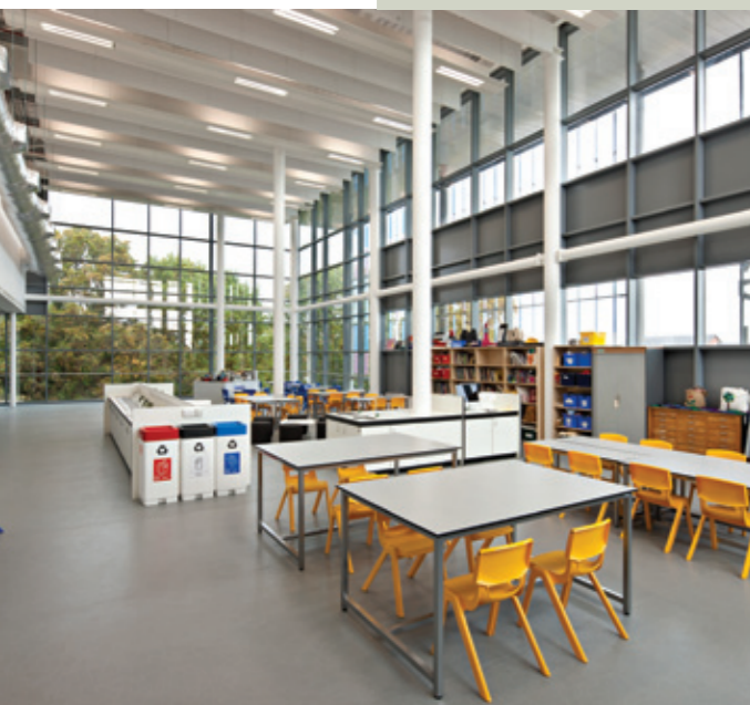
BEXHILL HIGH SCHOOL | UK

Where there is a risk of water spillage, flooring from the Polysafe ranges can be installed or if acoustics are a concern, highly realistic wood and stone designs are available for areas which require impact noise reduction.