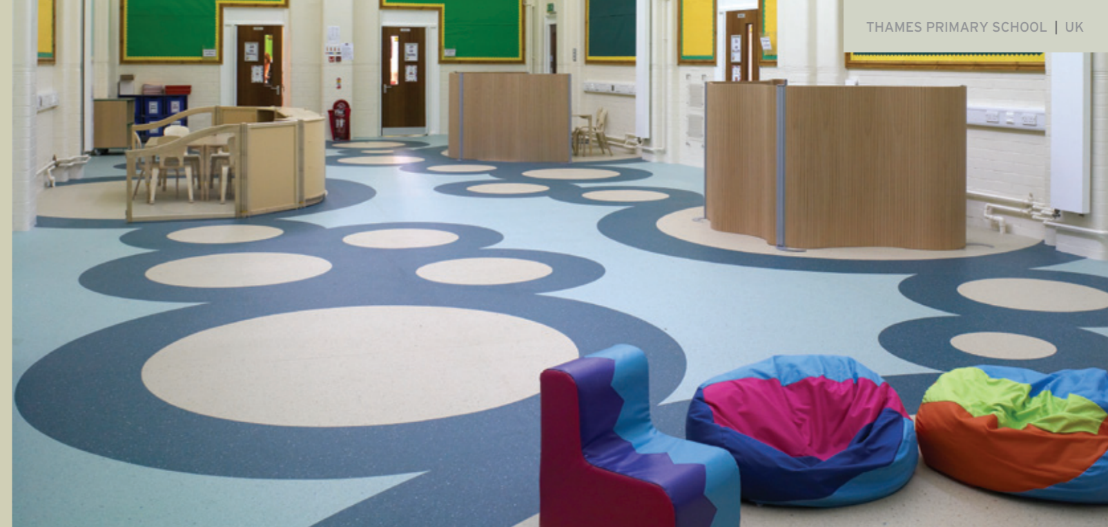
THAMES PRIMARY SCHOOL | UK

"Over 5,000m 2 of slip resistant Polysafe Standard PUR safety vinyl flooring has been installed at the pioneering £40 million Bexhill High School in East Sussex"