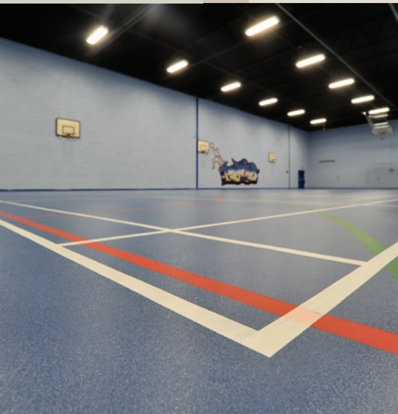
POLYSAFE HYDRO EVOLVE