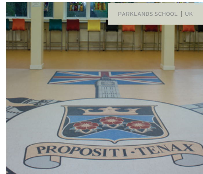
PARKLANDS SCHOOL | UK