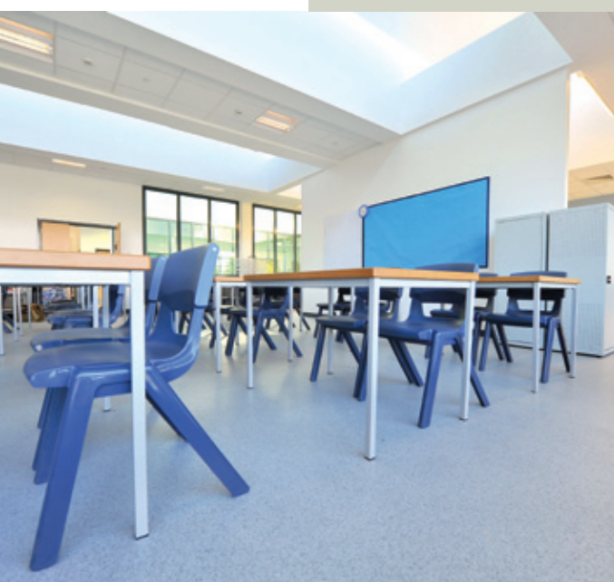
NORTH CHADDERTON SCHOOL | UK