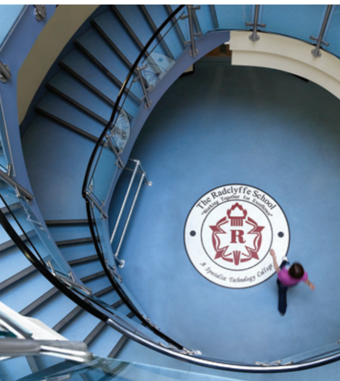
RADCLYFFE SCHOOL | UK