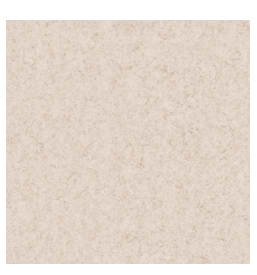
Riviera Taupe 2116