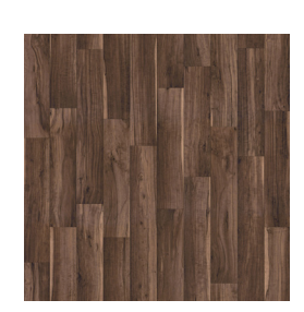
Sweet Chestnut 2132