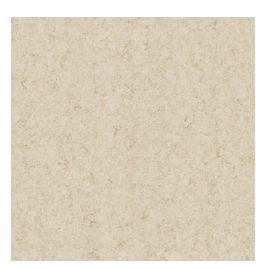
Riviera Sands 2115