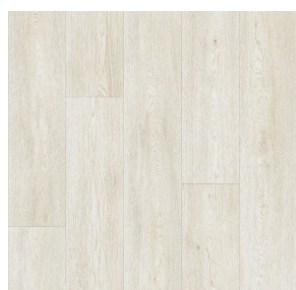
Columbian Oak 009S