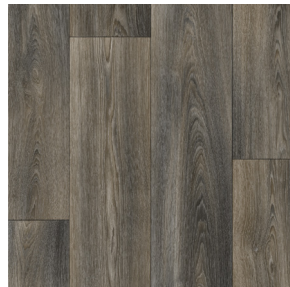
Columbian Oak 996D