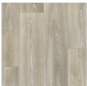
Columbian Oak 969L