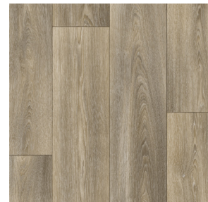
Columbian Oak 626M