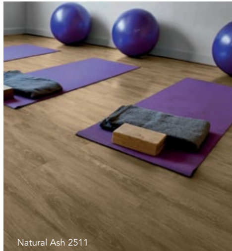
Natural Ash 2511