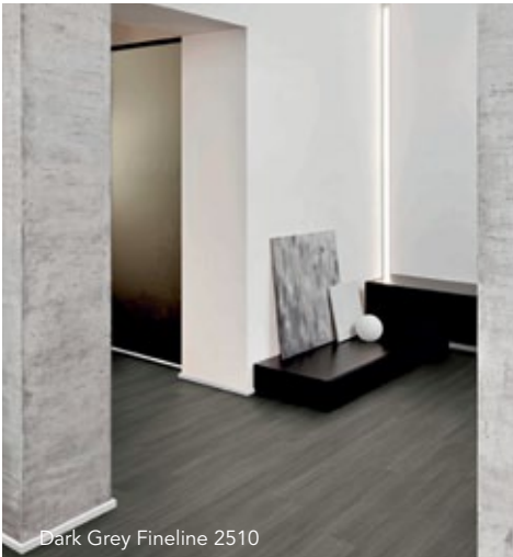
Dark Grey Finline 2510