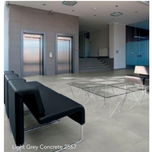
Light Grey Concrete 2567