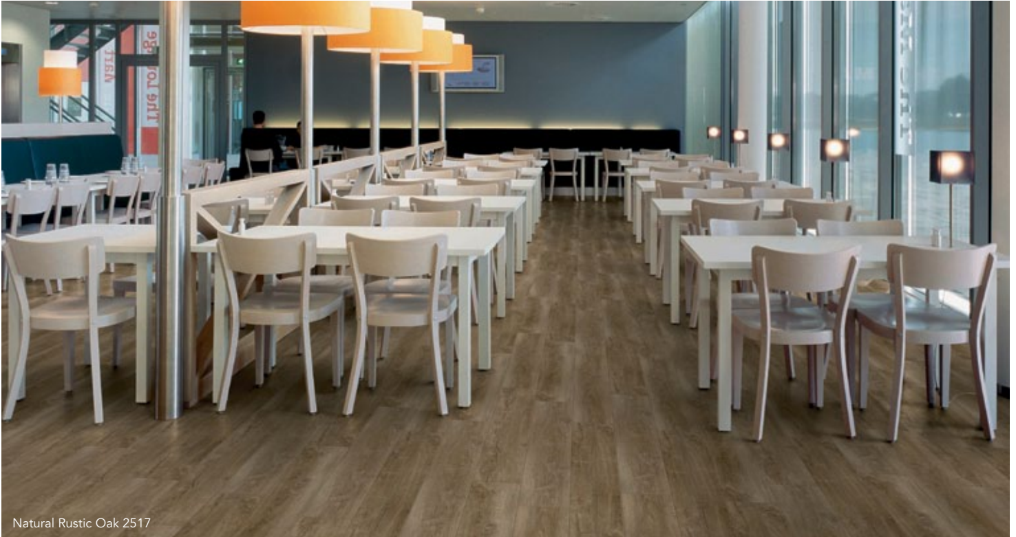
Natural Rustic Oak 2517

SimpLay is a loose lay product designed as a quick installation system. The functionality of the floor area is ensured by the net weight and the innovative special backing structure of the SimpLay product allows for an uncompromising loose installation. Ideal for retail, hotel and office fit-outs as well as for the home, the collection features timber inspired planks and concrete look tiles.