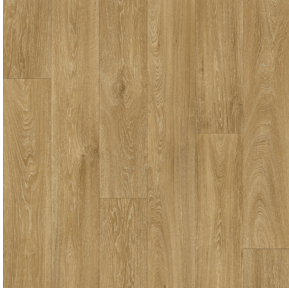
Liberty Oak 662M