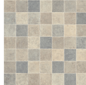
New York Grey 749L