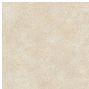
Radio City Marble 126S