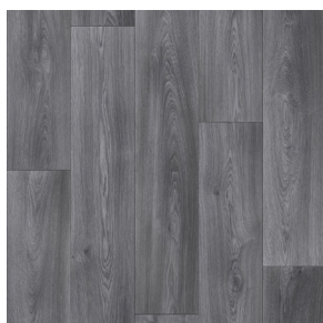
Warm Oak 909D