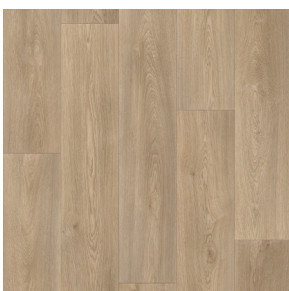
Warm Oak 613M