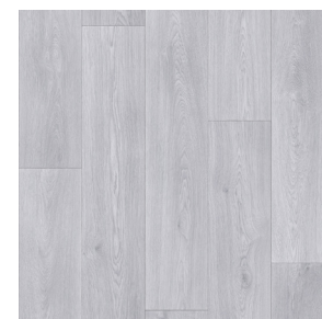
Warm Oak 997L