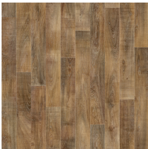
Ellis Distressed Oak 696M