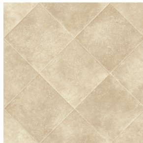
Rockefeller Limestone 206S