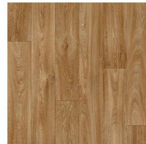
Ellis Antique Oak 602M