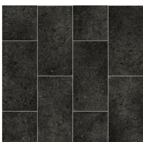
Broadway Slate 900E