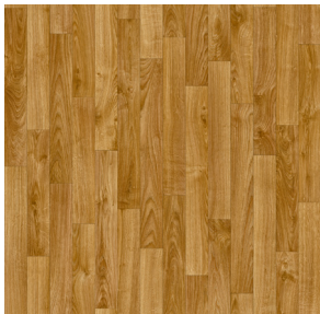
Liberty Honey Oak 643M