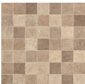
New York Cream 346L