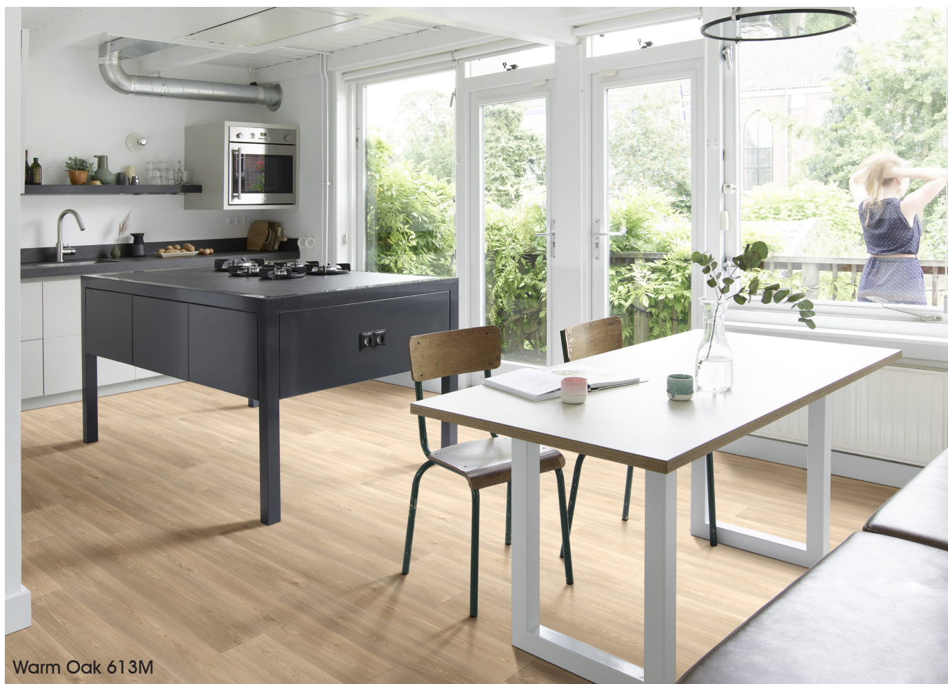
Warm Oak 613M