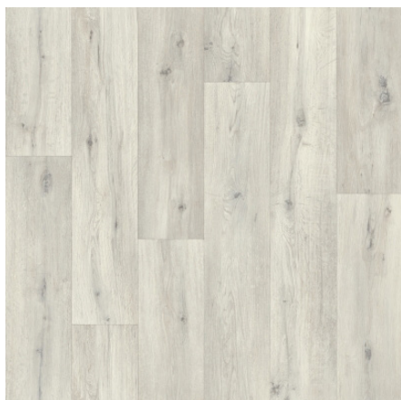
Silk Oak 109S