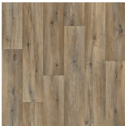
Silk Oak 167L