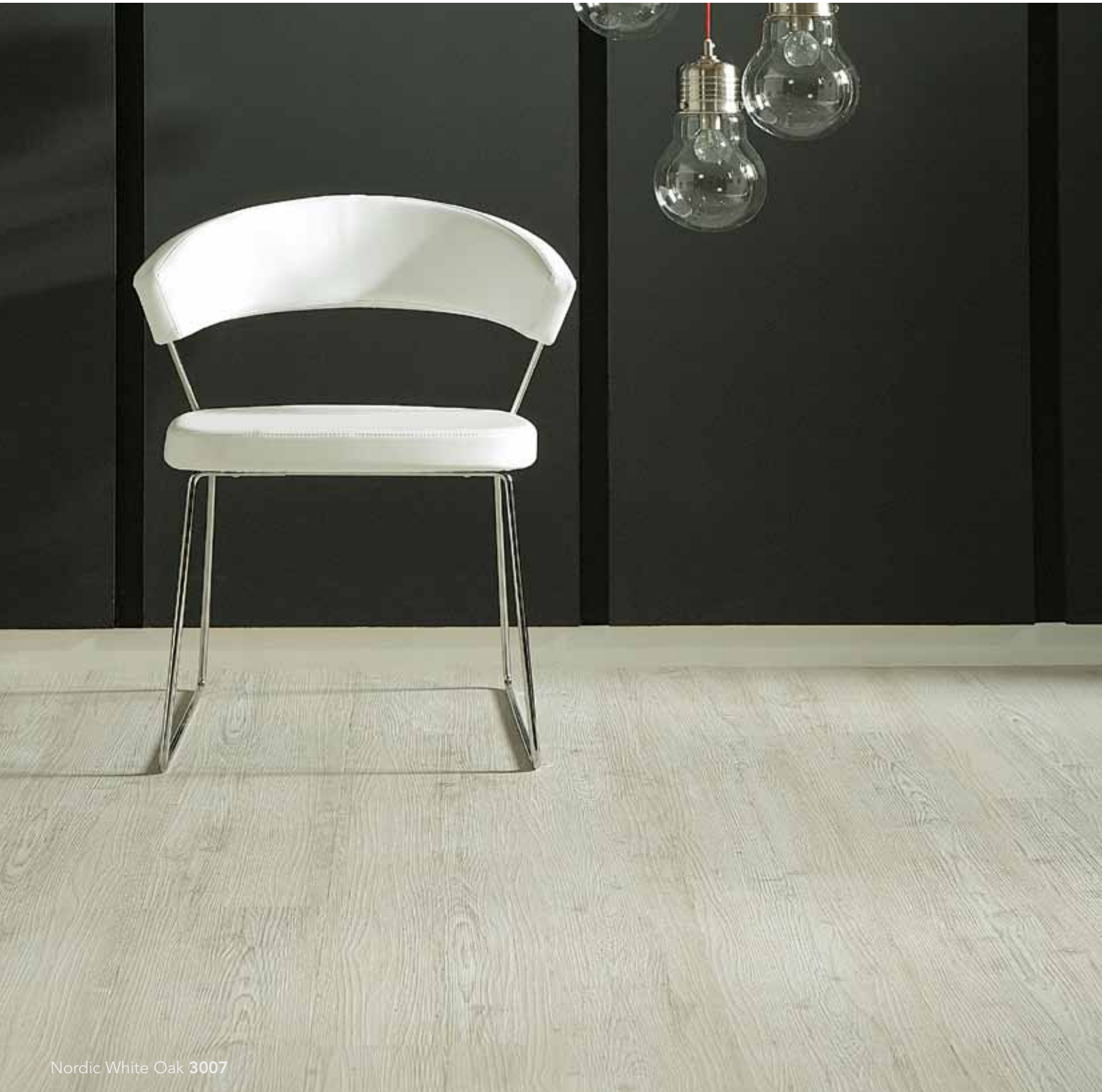
Nordic White Oak 3007