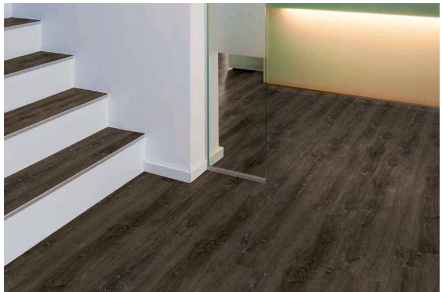
Brown Limed Oak 3005