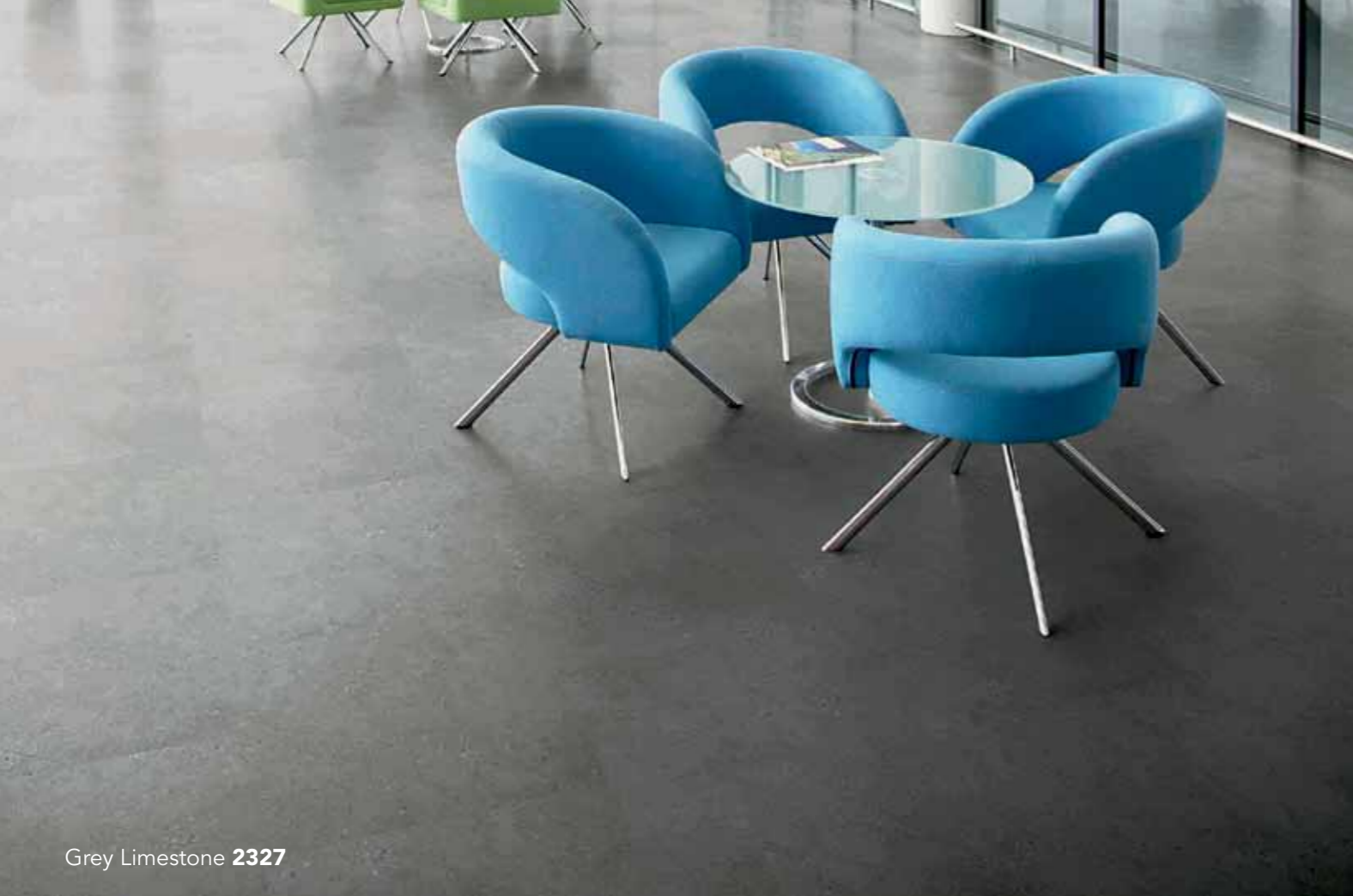
Grey Limestone 2327