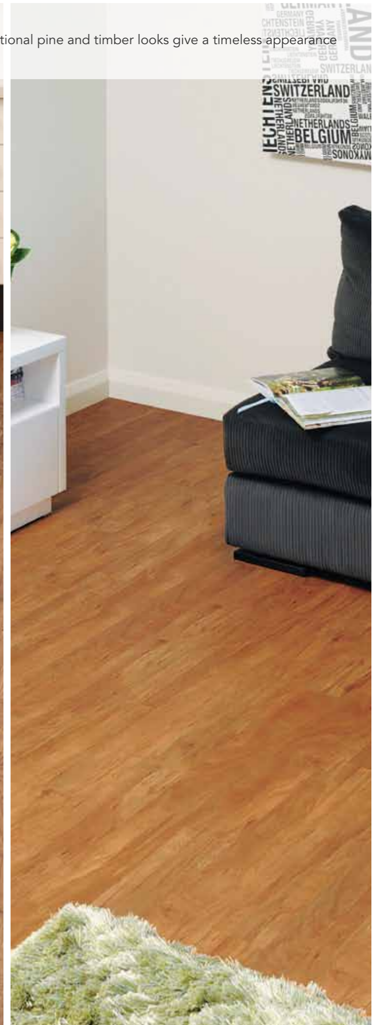
Baltic Pine 2208