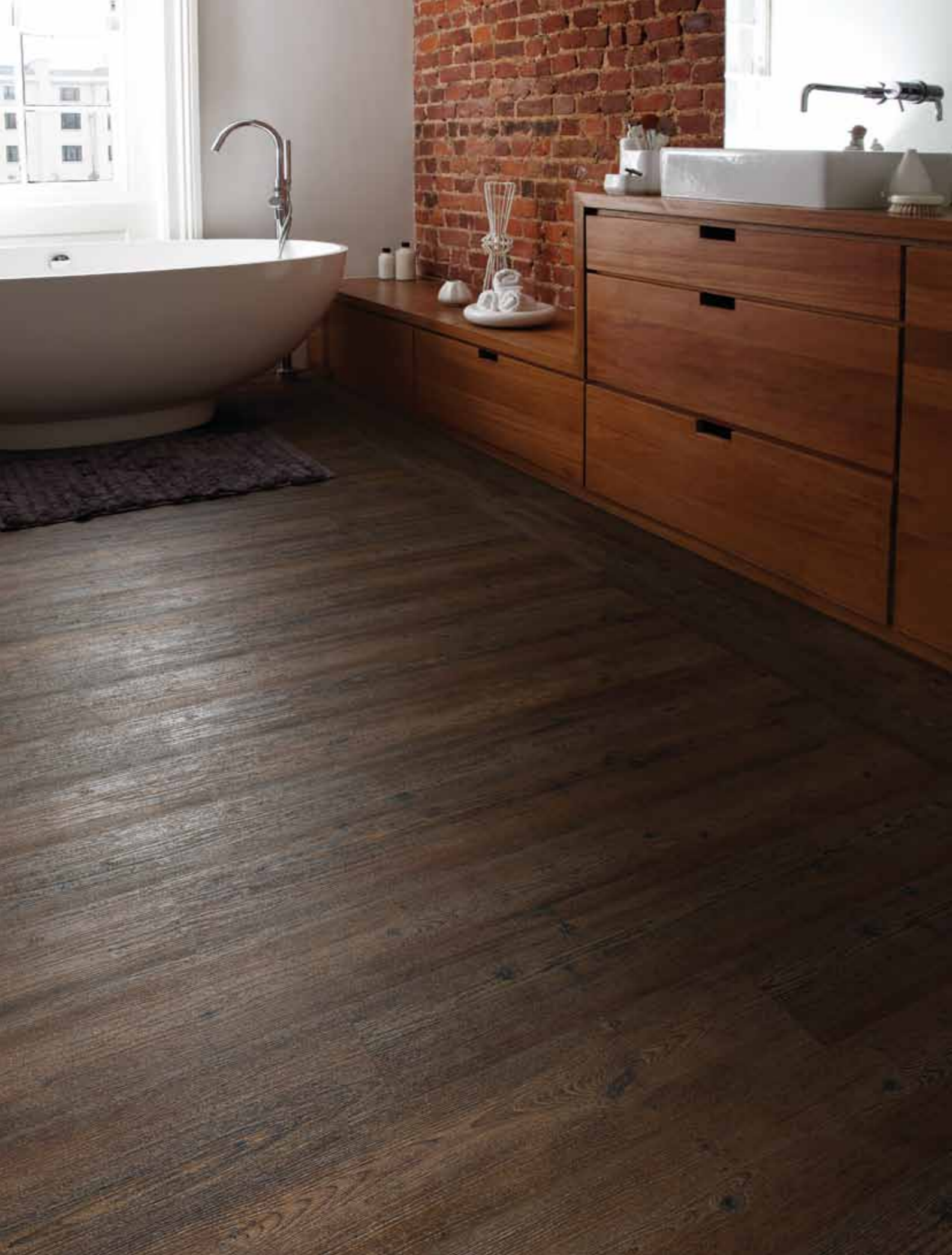
Kings Oak 3006