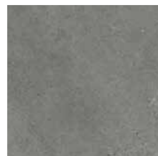
Grey Limestone 2327 457mm x 457mm