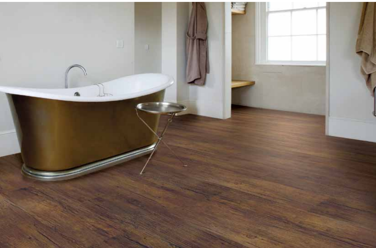
Wild Chestnut 3012