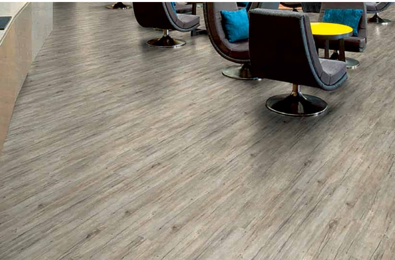
Grey Driftwood 3009