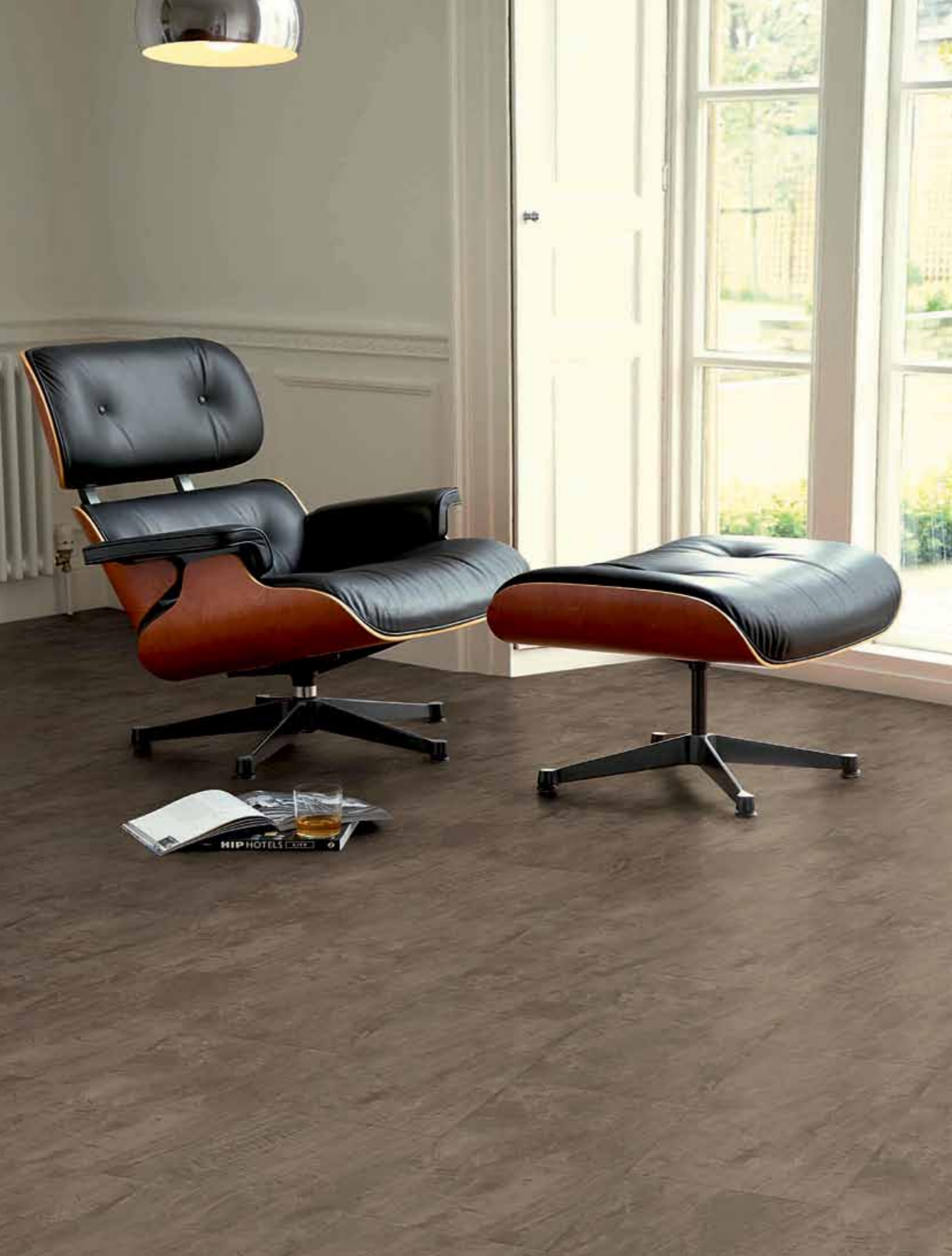
Slate Brown 3065