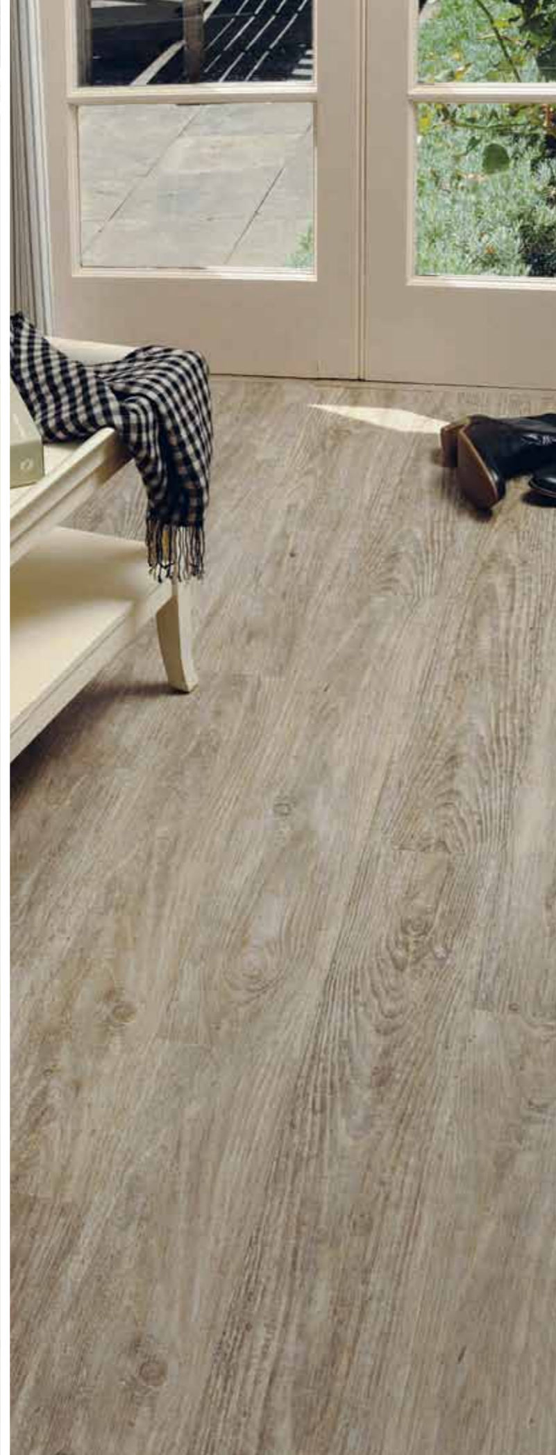
Washed Oak 3022