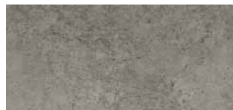
Light Filler Effect 2325 304mm x 609mm