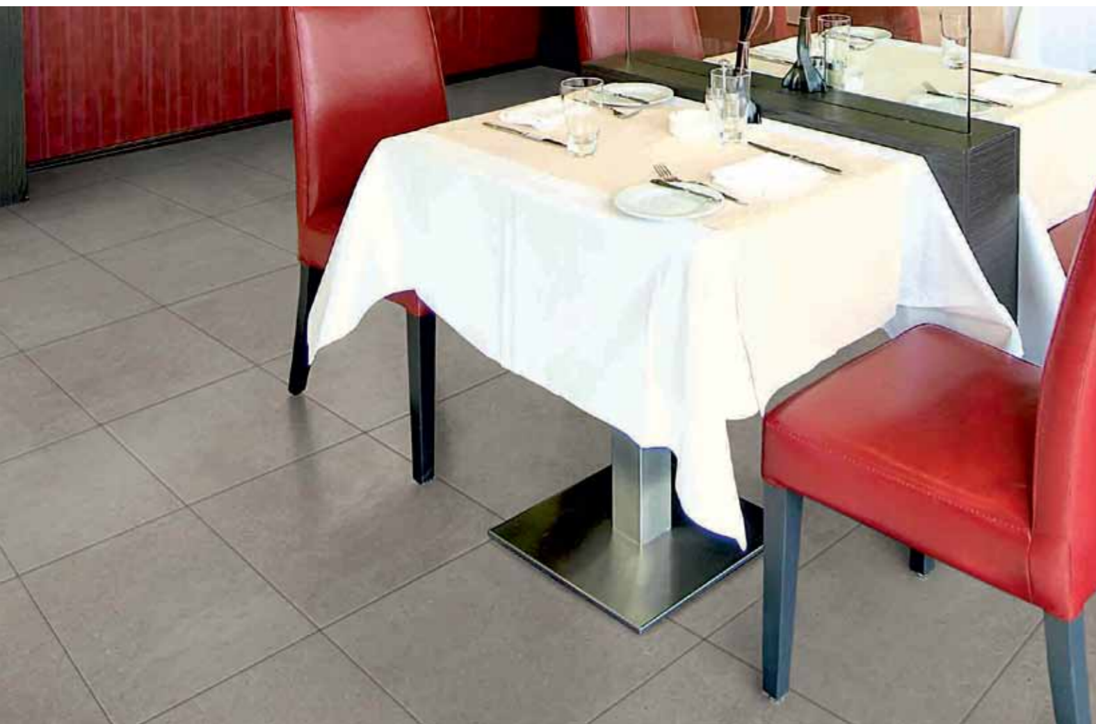
Natural Limestone 3066 with Mid Grey 5752 5mm Feature Strip