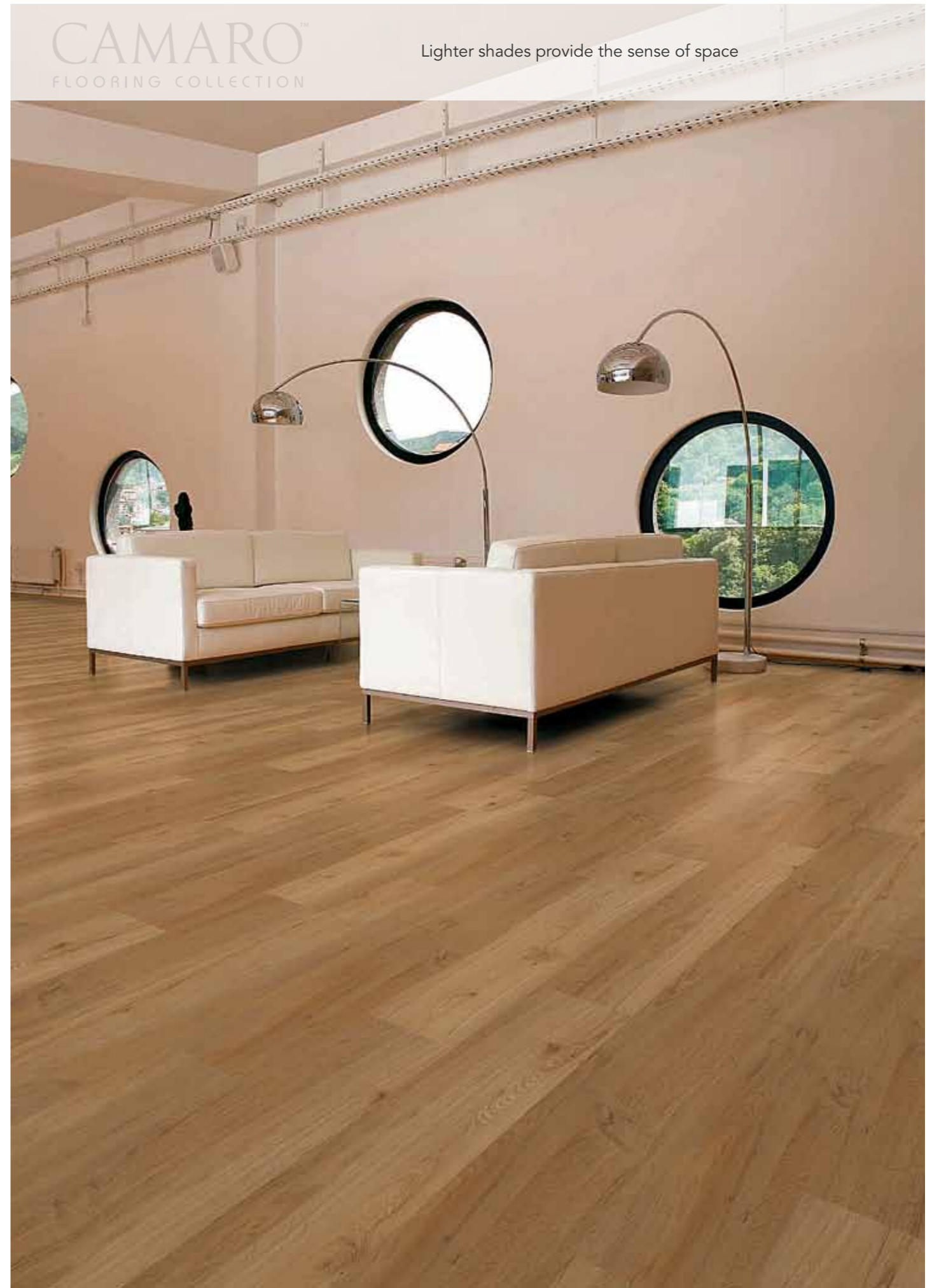
Blond Oak 3032