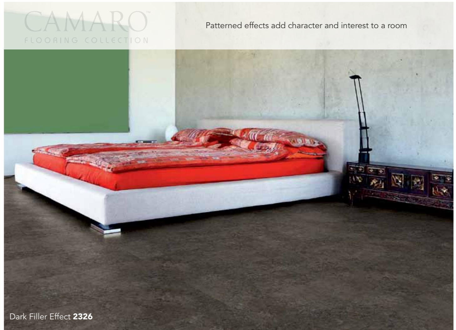
Dark Filler Effect 2326