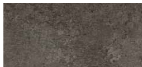
Dark Filler Effect 2326 304mm x 609mm