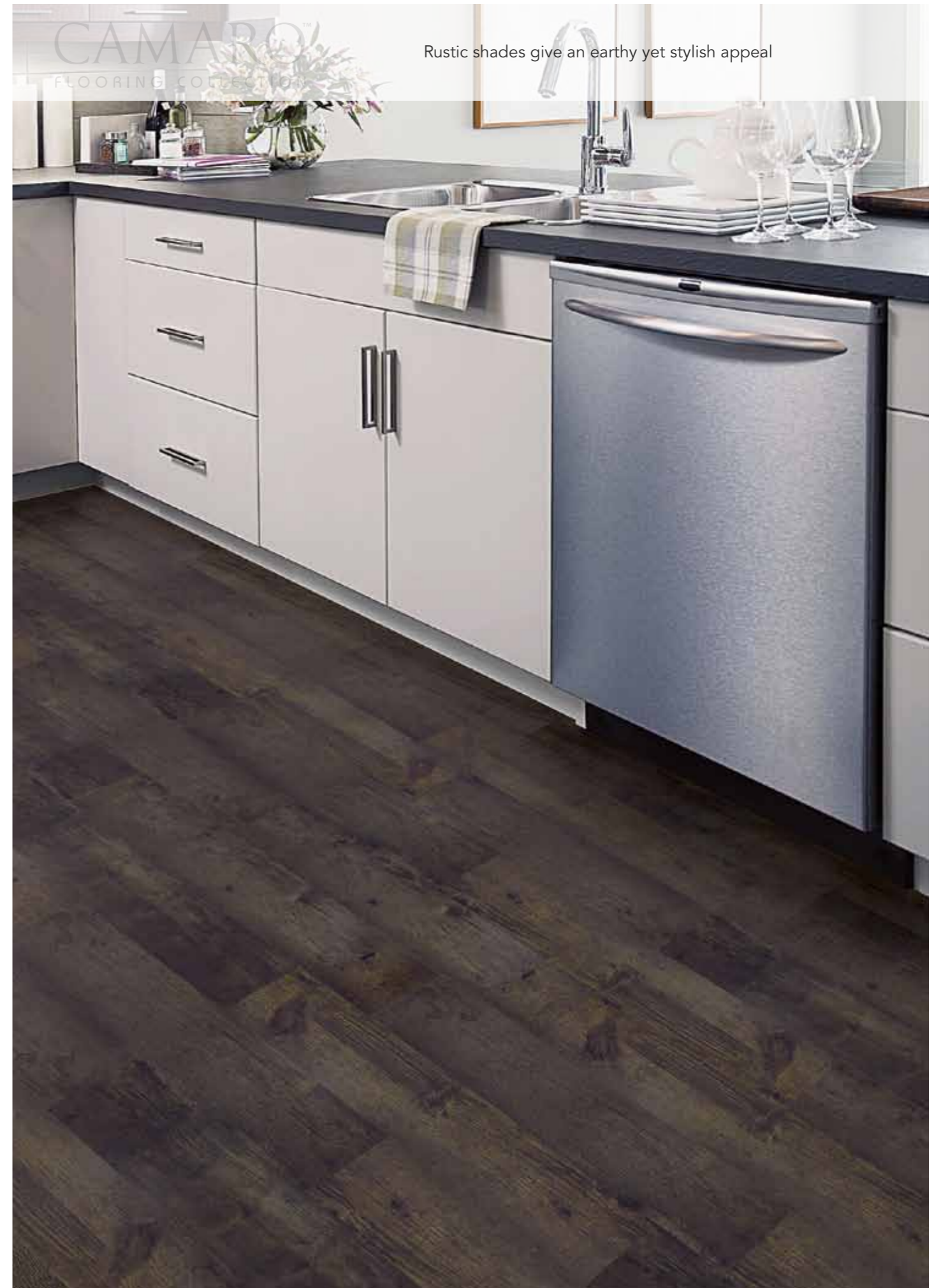
Burnt Rustic Wood 3014