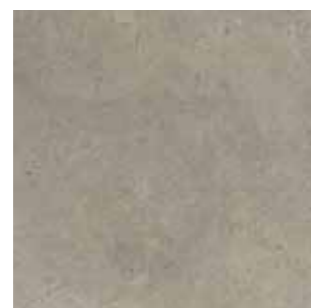
Natural Limestone 3066 457mm x 457mm