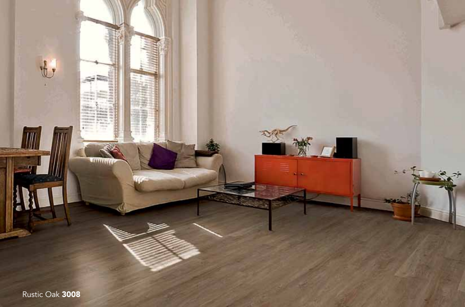
Rustic Oak 3008