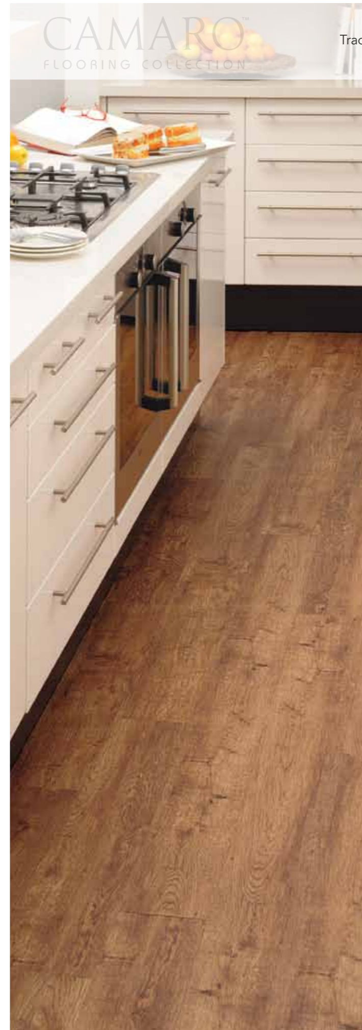
Vintage Timber 3046