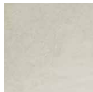
White Sandstone 2328 457mm x 457mm