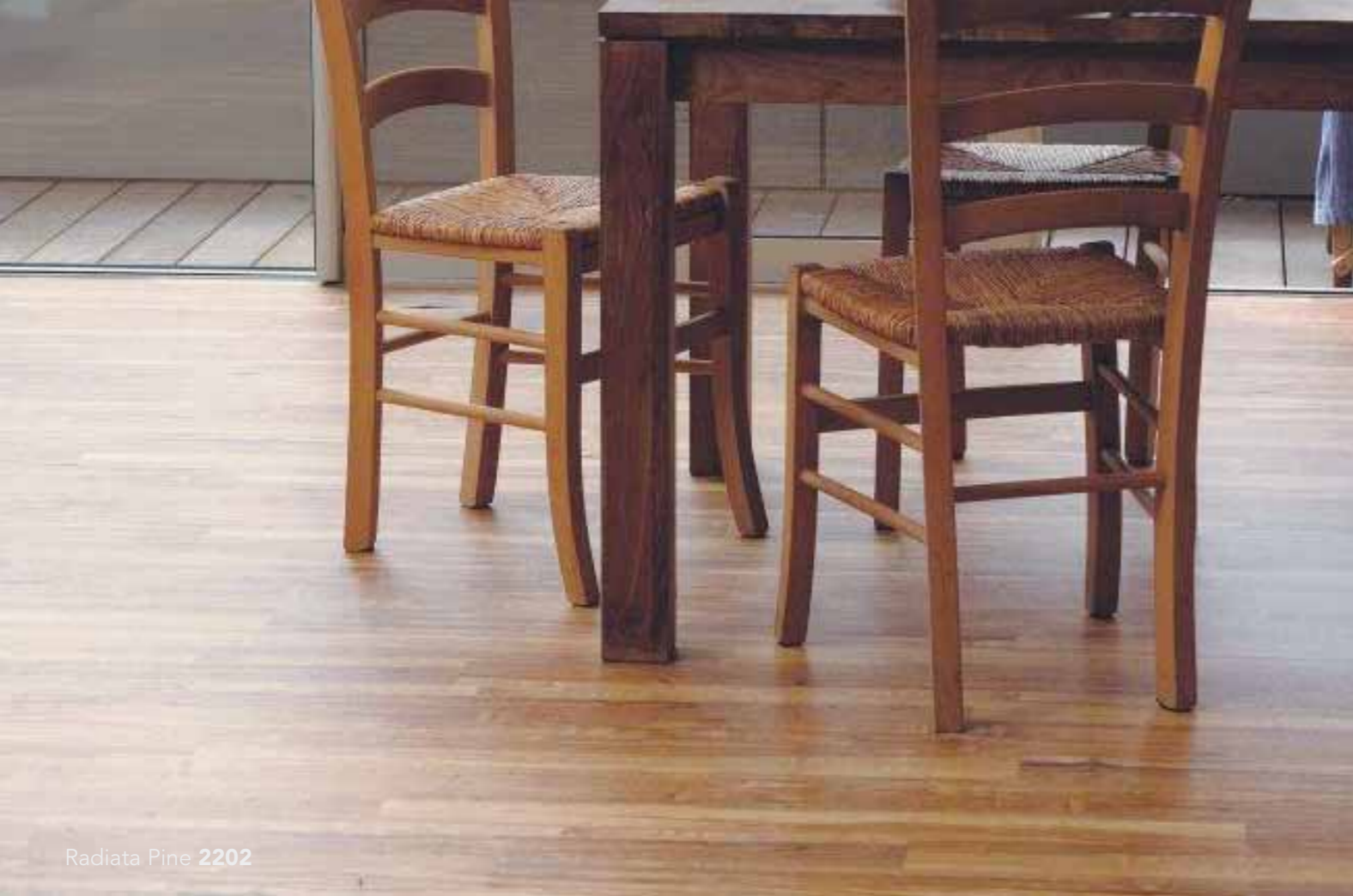
Radiata Pine 2202