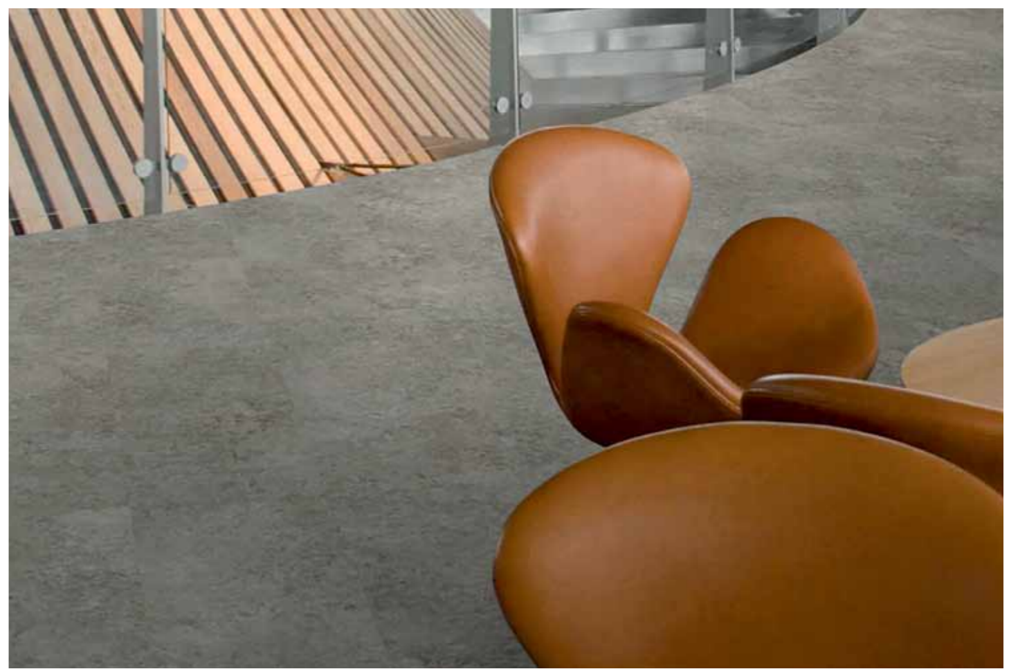
Light Filler Effect 2325