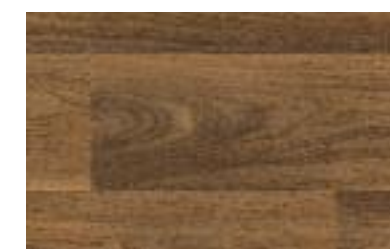
3120 French Walnut w/r 3120