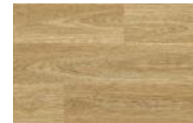
3380 American Oak* w/r 3380