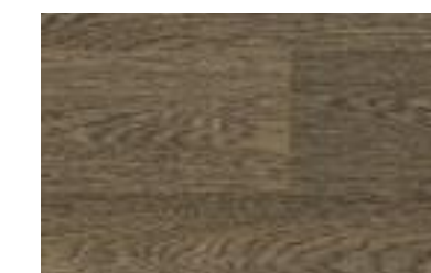
3150 Smoked Oak* w/r 3150