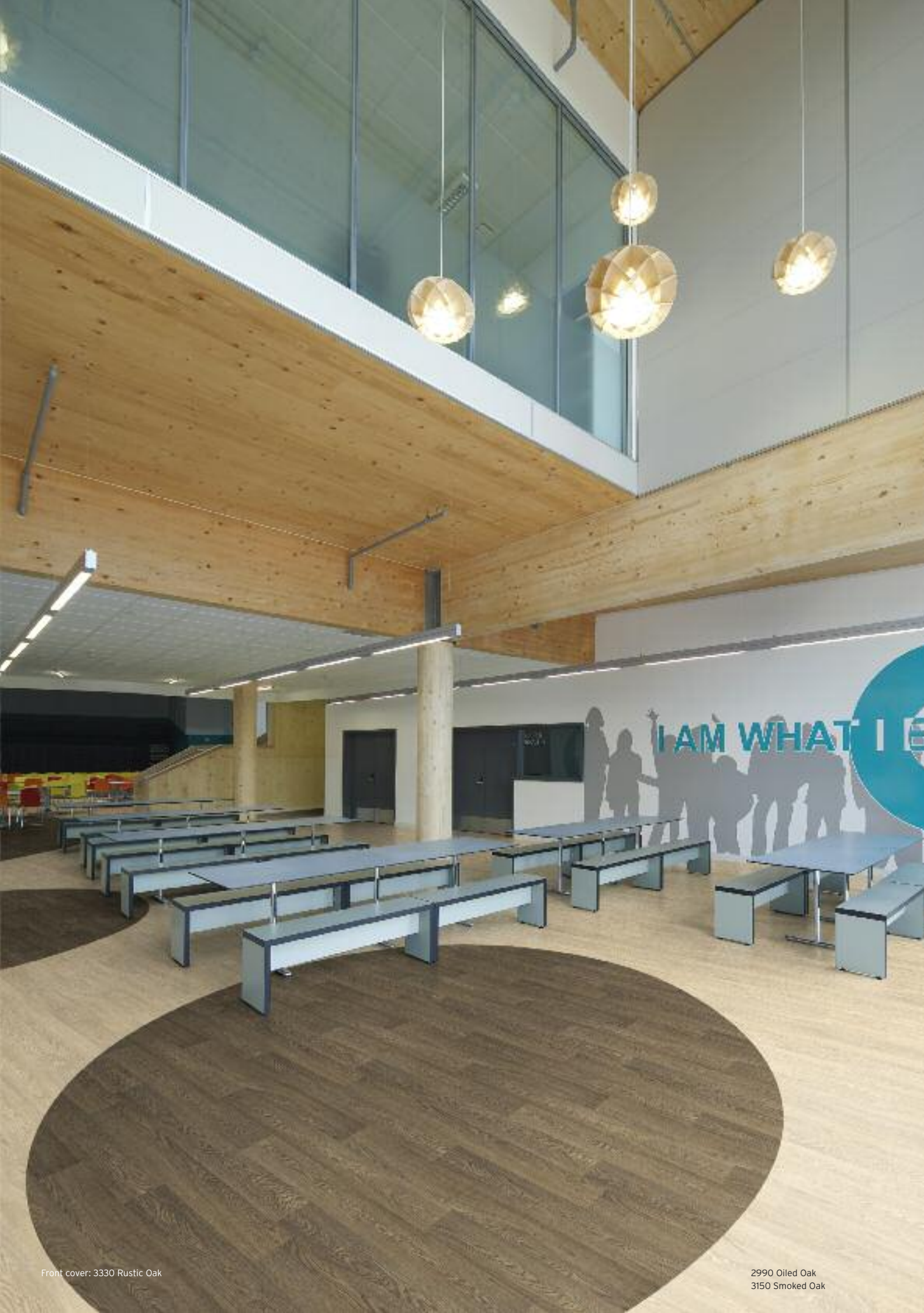
Front cover: 3330 Rustic Oak