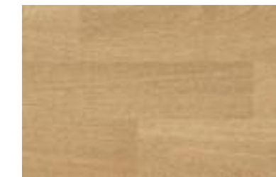
3290 Warm Beech* w/r 3290