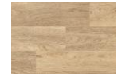
3090 Vermont Maple* w/r 3090