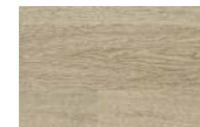
2990 Oiled Oak* w/r 2990