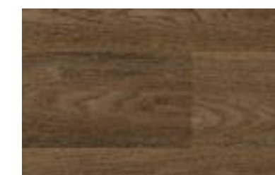
3230 Classic Walnut* w/r 3230

* Acoustic variants of these products are also available if impact sound reduction is required. See the Acoustix Forest fx and Acoustix Gallery fx collections.