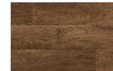
3110 Stained Maple* w/r 3110