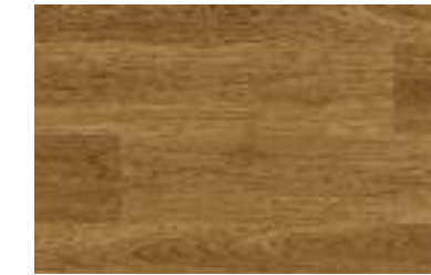
3340 European Oak* w/r 3340