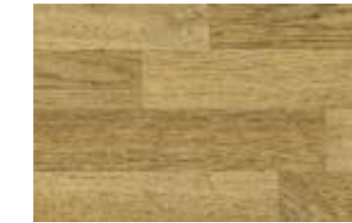
3330 Rustic Oak* w/r 3330