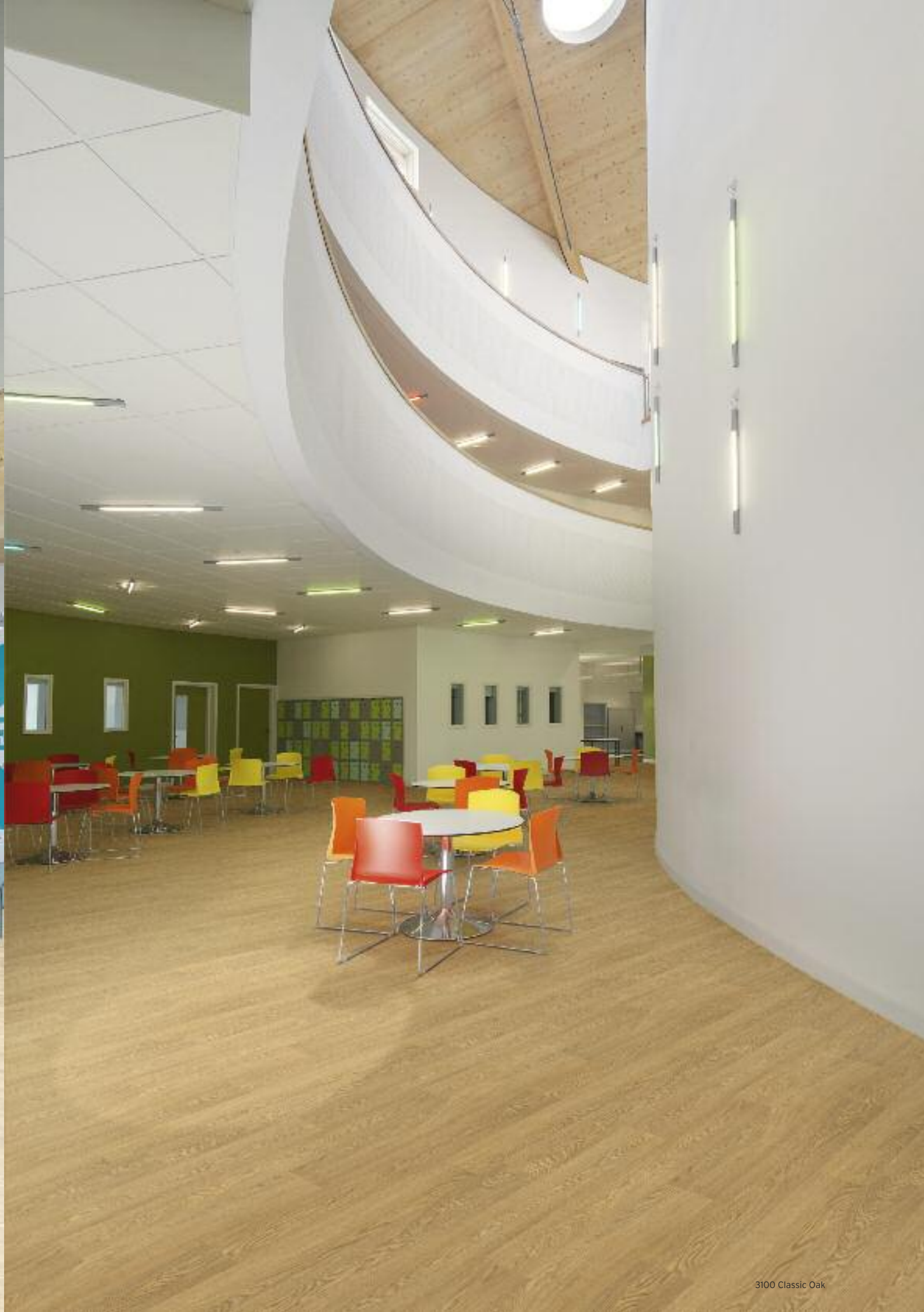
3100 Classic Oak

Forest fx represents the natural beauty and sophistication of wood in a practical and durable vinyl sheet format. This contemporary and wide-ranging palette is further enhanced by a variety of plank sizes, each carefully designed for natural authenticity.