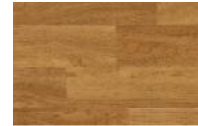
3310 Rich Cherry w/r 3310